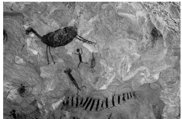
Toca da Entrada do Baixão da Vaca