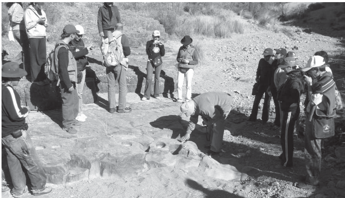
Figure 2. Fieldtrip participants examining natural, cupule-like features (potholes) at Chutu Kollu, near Tarata, central Bolivia.

he espouse a scientific and logical approach to the discipline, together with a deep personal commitment, his infectious enthusiasm will, I predict, ensure that we will hear much more from this young researcher. And he is not alone, Andean archaeology is developing rapidly into a modern discipline freeing itself of the intellectual vestiges of colonialism.